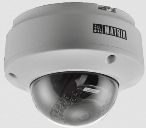
SATATYA CIDR30MVL12CW-P 3MP IR Dome Camera with 2.8-12mm Lens

Matrix project series IP Cameras are built using superior components such as Sony STARVIS sensor and higher MTF lens to offer unmatched image quality especially during the low light conditions. Powered by True WDR algorithm, these cameras offer consistent image quality even in highly varying lighting conditions. Built in intelligent analytics including Intrusion Detection, Trip Wire, etc. ensure real-time security. Moreover, H.265 compression and Automatic Motion based Frame Rate Reduction save bandwidth and storage up to 50%.